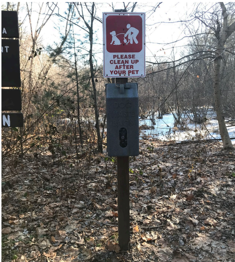
Pet waste disposal station

Prefabricated pet waste stations require minimal assembly and are easily installed. There is signage that identifies the station and its presence communicates an interest in keeping public and open space areas clean and healthy for all users and our watersheds clear of contaminants.